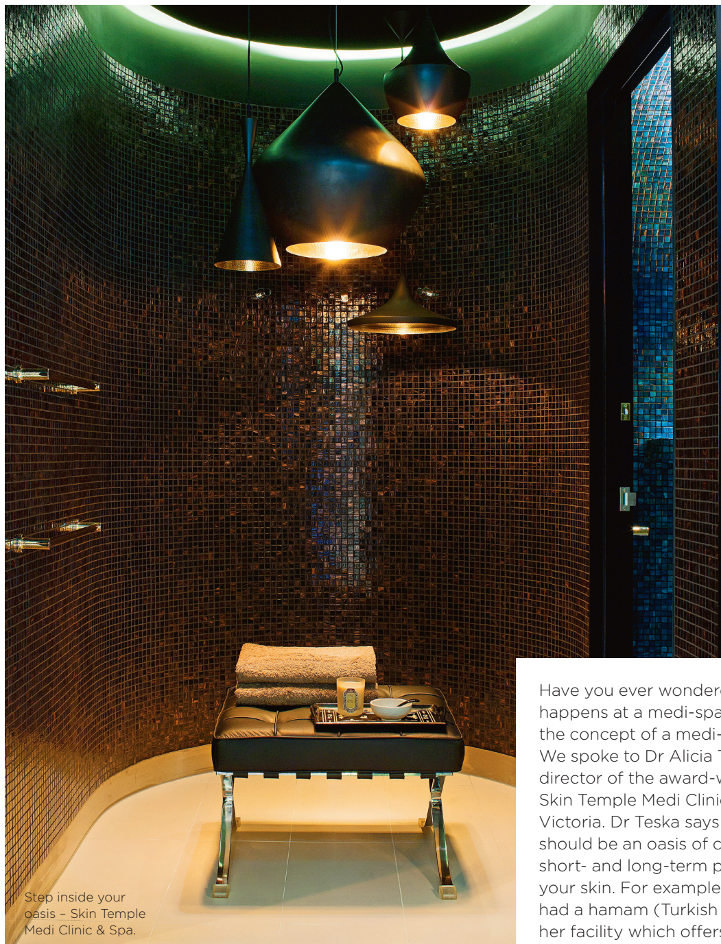
Step inside your oasis – Skin Temple Medi Clinic & Spa.